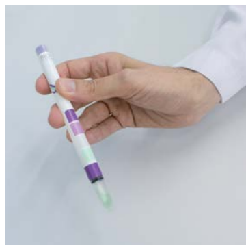
Test of protean analysis