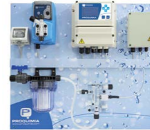
Clorimatic Aljibe Cloro