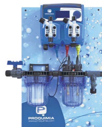
Clorimatic pH / Redox

Products used for pool water treatments must not be added directly into the pool, according to current legislation. They may cause injuries to the user as well as damages on the surfaces. The application of products by means of dosing dispensers, is therefore recommended.