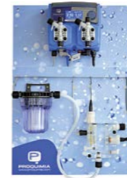
Clorimatic Aljibe Cloro-pH