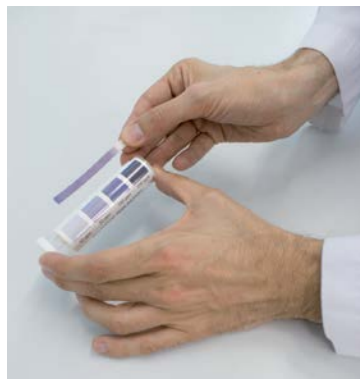
Test of chlorine analysis

In addition, Proquimia has its own microbiological and water analysis laboratory, approved by the "Generalitat de Catalunya" with the Register R7-189-04. This laboratory is available to those clients who wish to carry out specific tests..